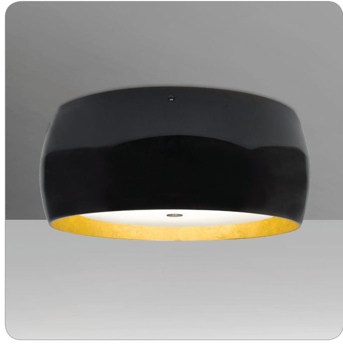
BLACK/INNER GOLD FOIL (POGOGF)